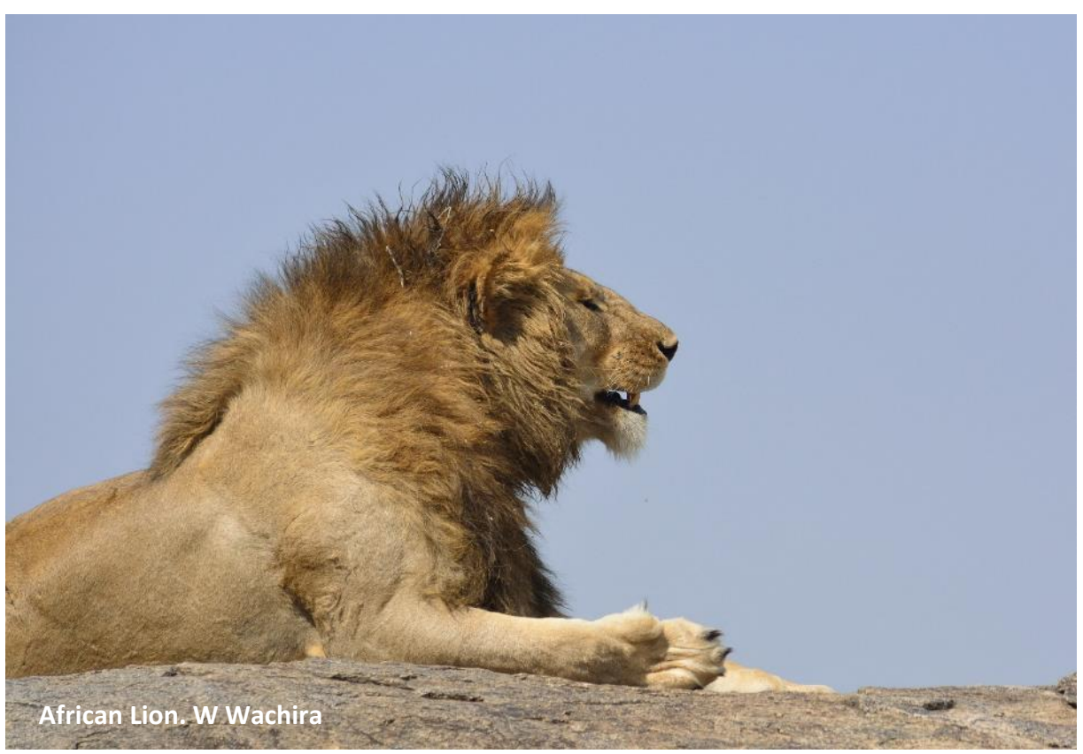
Days 6 & 7. Saturday 2 and Sunday 3 December 2023. Masai Mara National Reserve. We will spend the next two days in the vast Masai Mara in search of local birds and mammals. Described by many as the top reserve in Kenya, this area has lots to offer, from the Big Five, herds of grazing mammals, to the amazing birdlife. Mammals here include Common Hippopotamus, Common Warthog, Lion, Cheetah, Leopard, Spotted

Hyena, Topi, Grant's Gazelle, Bushbuck, Bohor Reedbuck, Silver-backed Jackal, Common Eland, Common Zebra, African Buffalo and Thompson's Gazelle. We shall also spend time in the reserve birding in this vast savannah. Likely species include Southern Ground-Hornbill, Rufous-bellied Heron, Dusky Nightjar, Schalow's Turaco, Grey-crested Helmet-shrike, Red-necked Spurfowl, Red-winged Francolin, Bare-faced Goaway-bird, Rufous-chested Swallow, Lappet-faced Vulture, White-headed Vulture, Ruppell's Vulture, Secretarybird, Grey Kestrel, Temminck's Courser, Rosy-breasted Longclaw, Green-capped Eremomela, Black Coucal, African Quailfinch, Kori Bustard, Melodious Lark, Flappet Lark, Athi Short-toed Lark, Rufous-tailed Weaver, Grey-capped Social Weaver, Black-backed Cisticola, Long-tailed Cisticola, Pale Wren-Warbler, Usambiro Barbet, Familiar Chat, Sooty Chat, African Wattled Plover, Woolly-necked Stork, Saddle-billed Stork and Magpie Shrike.