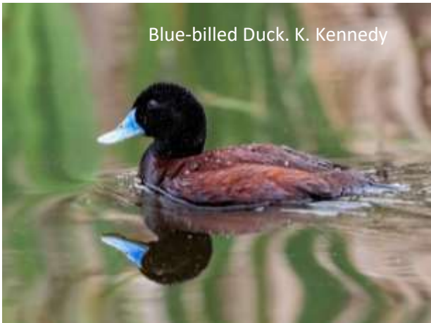
Blue-billed Duck. K. Kennedy

Today has been set aside as an arrival day so you are free to arrive at any time that suits your travel plans. You are to make your own way to the hotel (the hotel does provide a transfer service from Perth airport) and we will meet at the hotel at 7.00pm for a brief orientation and welcome dinner. Please note that no activities have been planned for today. Accommodation: Perth (en suite rooms). Meals included: D.