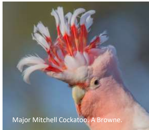
Major Mitchell Cockatoo. A Browne.

Today we continue our travels inland and North to Mount Magnet. Past Wubin we pass through an area of sand plain heath which should have extensive flowering. We will look out for Red-tailed Black-Cockatoo (race samuelyi ), Western Corella (race derbyi ), and Black-breasted Buzzard. En route to Mount Magnet we have chances Bourke's Parrot, Mulga Parrot, Banded Lapwing, Black-tailed Native-hen. If we have time, we may make a diversion to look for Grey Honeyeater, Mulga Parrot, Little Woodswallow, Orange Chat and Crimson Chat. We could get lucky and find Major Mitchell's Cockatoo. If the weather allows, we will try to access a river with a series of pools lined with thick flowering vegetation located to the south-east of Mt Magnet. We will target White-browed Treecreeper, Gilbert's Whistler, Southern Scrub-robin, Mistletoebird and any honeyeaters in the flowering vegetation. We may even have the opportunity to look for Western Quail-thrush. Tonight is the first of a two night stay in Mount Magnet. Accommodation: Mount Magnet (en suite cabin). Meals included: B, L, D.