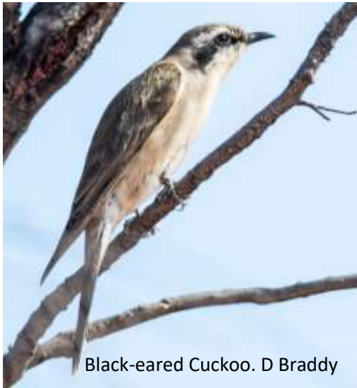
Black-eared Cuckoo. D Braddy