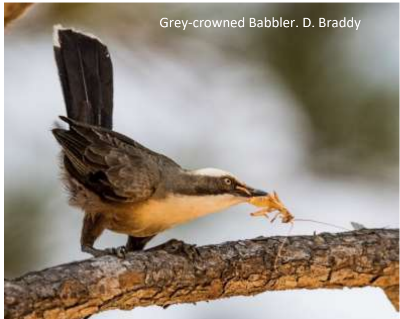
Grey-crowned Babbler. D. Braddy

We drive 1.5 hours north to Kalbarri at the mouth of the Murchison River. We will spend much of the time in the heathland of Kalbarri National Park where there should be a profusion of flowers attracting honeyeaters including the WA endemic Western Spinebill and Western Wattlebird, as well as Tawny-crowned Honeyeater, White-cheeked Honeyeater and chances of the nomadic Pied Honeyeater, Black Honeyeater and White-fronted Honeyeater. There are good chances of Blue-breasted Fairywren and Western Yellow Robin. Other birds in the area include Rufous (Western) Fieldwren ( ssp montanellus ) – a possible future split, Rainbow Bee-eater, White-plumed Honeyeater, Peaceful Dove, Hooded Robin, Southern Scrub-robin, cuckoos and a variety of raptors, hopefully including Square-tailed Kite. En route back to Geraldton, we may visit a saltworks where we may find Banded Stilt and Red-necked Avocet. Accommodation: Geraldton (en suite room). Meals included: B,L,D.