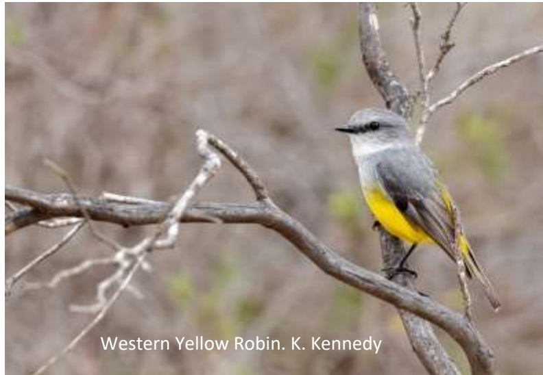
Western Yellow Robin.