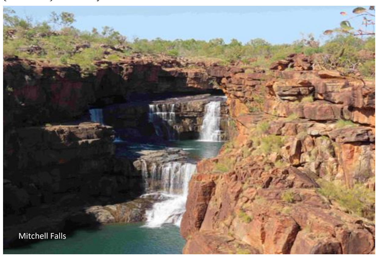
Day 7. Saturday 10 August 2024. Mitchell Plateau to Drysdale River Station. After a final look around the area we will fly back to Drysdale River Station, where we can explore the environs of this huge property. Around Drysdale Station we will look for the star attractions of the area - Purple-crowned Fairywren and Crested (Northern) Shrike-tit (the very scarce northern subspecies whitei ), found in the tropical eucalypt woodlands on the station. The fairywrens live in the pandanus-lined waterways where we can also see Azure Kingfisher, Buff-sided Robin, Crimson Finch, White-gaped & Rufous-throated Honeyeaters and Black Bittern.

Accommodation: Lodge on Mitchell Plateau (tented cabins) for 2 nights. Meals included: B (continental) LD each day.